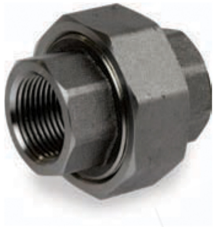
Fig. 42U 3 - Union